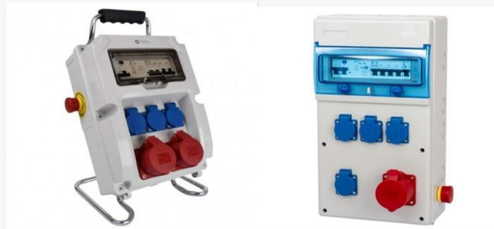
Single-phase + three-phase pre-equipped site box with emergency stop