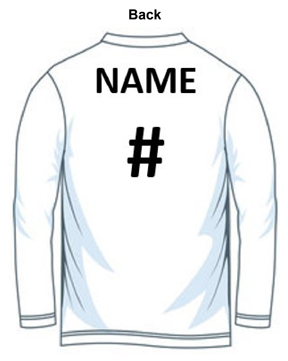
# Rider's number